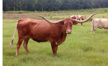
DUNN DOUBLE TAKE