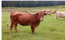
DUNN DOUBLE TAKE