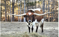
DUNN ASSET ANNIE