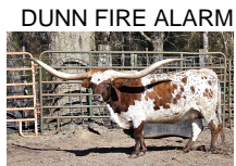
DUNN FIRE ALARM